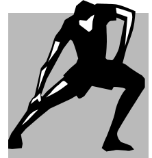
Health & Fitness

Since 1991 over 129,000 children and parents have enjoyed participating in sports camps built on Future for Kids concepts. Youth sports and academic curriculum camps provide an environment of positive participation and life-skills development. The camp experience empowers young boys and girls to become strong and productive leaders in society. Directed toward active participation, our program focuses children on positive reinforcement while building self-esteem and raising skill levels.